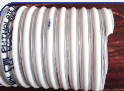
PVC Suction Delivery Hose Food Grade - Phthalate Free with ANT Copper Wire Wall Thick. 3 to 5 mm