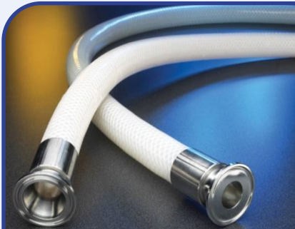
Silicone Braided Hoses