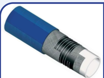
FDA - Phthalate Free Hose Milk, Dairy Products & Fatty Food