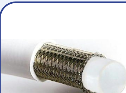
Silicone Hose with SS 304 Braiding and PTFE Inner Lining