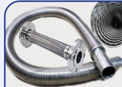
SS Flexible Corrugated Hoses (SS 304)