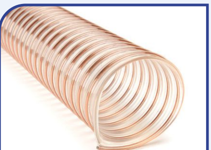
PU Hose with spring steel wire reinforcement. Food Grade Wall Thick. 06. / 1 / 1.2 / 2.5 mm