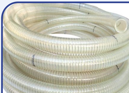
PU Hose with spring steel wire reinforcement. Food Grade Wall Thick. 4 mm