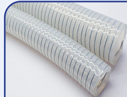
Silicone Hose Reinforced with SS 316 L Wire