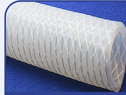
Silicone Hose Reinforced with Polyester Yarn and SS 316 L Wire