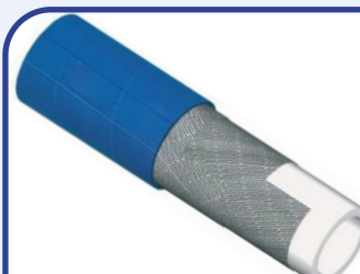
EPDM - FDA Steam Hose