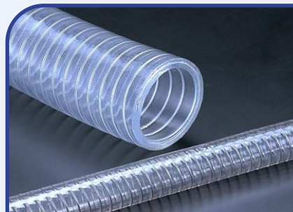
PVC Steel wire hose Food Grade Phthalate Free Wall Thick. 3.5 to 7 mm