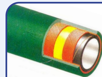
XLPE Chemical Hose