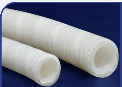
Silicone Hose Reinforced with 2/3 Plies of Polyester fabric and SS 316 L Wire