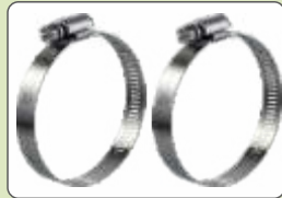
S.S. HOSE CLAMP