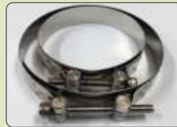
S.S. / M.S BOLT HEAVY TYPE & O.H.T.C. HOSE CLAMP