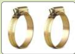
M.S. HOSE CLAMP

NYLON (POLYAMIDE) CONDUIT PIPES AND GLANDS Temp.: -10°C to +90°C