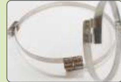
S.S. BRIDGE CLAMP