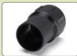
Standard crip cuff

Black screw cuff with a standard thread in different diameters. Other colours on request.