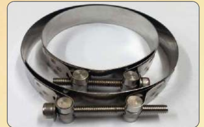
S.S. / M.S BOLT HEAVY TYPE & O.H.T.C. HOSE CLAMP