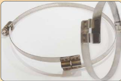
S.S. BRIDGE CLAMP