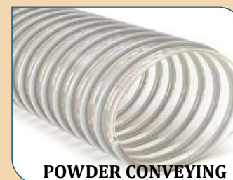
PU HOSE WITH RIGID HELIX Serie 3PUR S - AL