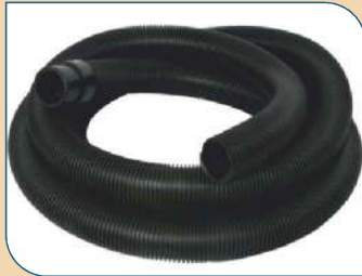
EVA PROFILE HOSE INDUSTRIAL VACUUM CLEANER HOSE SWIMMING POOL HOSE