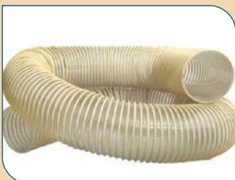
PVC FLEXIBLE DUCT HOSE