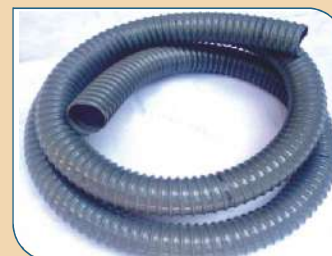
PVC FLEXIBLE DUCT HOSE