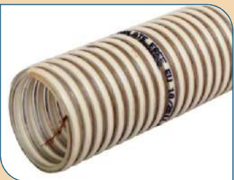
PVC SUCTION & DELIVERY FOOD GRADE HOSE -FLEXANT FOOD GRADE / PHTHALATE FREE / ANTISTATIC