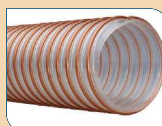
PU HOSE - EXTRA HEAVY DUTY Ether Grade

Temp. -40°C to +100°C (Short-term: +125°C)