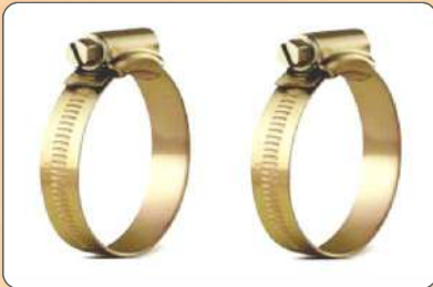
M.S. HOSE CLAMP