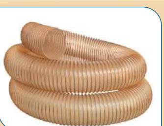
PU HOSE - HEAVY DUTY Ether Grade

Temp. -40°C to +100°C (Short-term: +125°C)