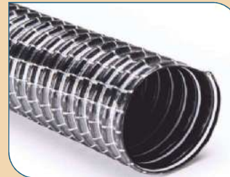
VAT-ELASTIC HOSE VACUUM CLEANER HOSE