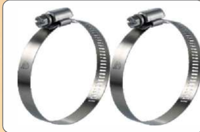
S.S. HOSE CLAMP