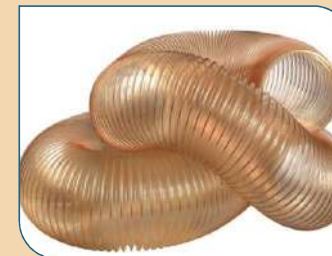
PU HOSE - LIGHT DUTY