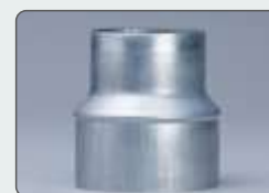
Reducer For connecting light and middle weight