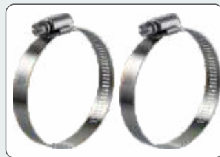
S.S. HOSE CLAMP