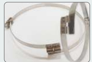
S.S. BRIDGE CLAMP