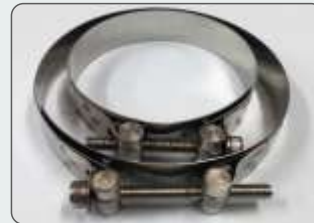
S.S. / M.S BOLT HEAVY TYPE & O.H.T.C. HOSE CLAMP