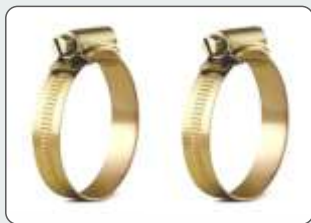
M.S. HOSE CLAMP

HIGH PRESSURE AIR CLEANING HOSES Range :8.5 mm to 20 mm W.P. 30 to 60 kg/cm 2 B.P. 120 to 225 kg/cm 2