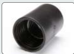
Coupling Screw cuff for different hoses and diameters.