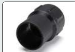
Standard crip cuff Black screw cuff with different threads and out of various materials. Other colours on request.