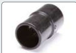
Screw cuff Black screw cuff with a standard thread in different diameters. Other colours on request.