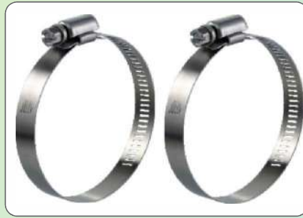
S.S. HOSE CLAMP