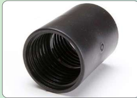
Coupling Screw cuff for different hoses and diameters.