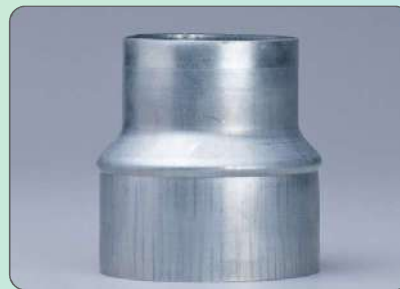
Reducer For connecting light and middle weight