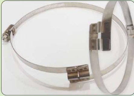
S.S. BRIDGE CLAMP