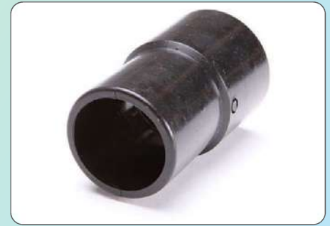
Screw cuff Black screw cuff with a standard thread in different diameters. Other colours on request.