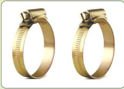
M.S. HOSE CLAMP