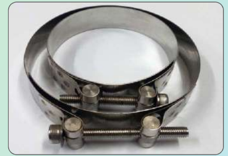
S.S. / M.S BOLT HEAVY TYPE & O.H.T.C. HOSE CLAMP