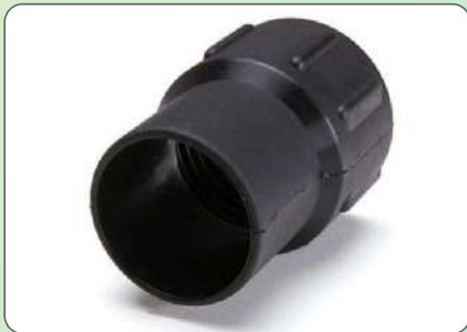
Standard crip cuff Black screw cuff with different threads and out of various materials. Other colours on request.