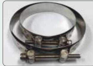
S.S. / M.S BOLT HEAVY TYPE & O.H.T.C. HOSE CLAMP