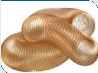
PU HOSE - LIGHT DUTY Ether Grade