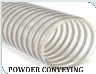
PU HOSE WITH RIGID HELIX Serie 3PUR S - AL FOOD GRADE