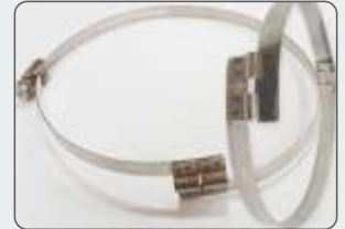
S.S. BRIDGE CLAMP