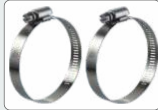
S.S. HOSE CLAMP