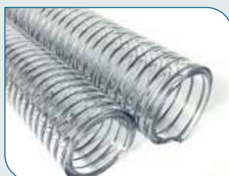
PVC STEEL WIRE HOSE THUNDER HOSE FOOD GRADE PHTHALATE FREE