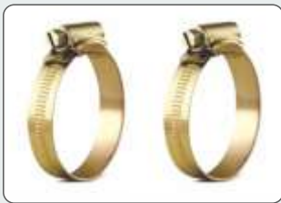
M.S. HOSE CLAMP

NYLON (POLYAMIDE) CONDUIT PIPES AND GLANDS Temp. : -10°C to +90°C