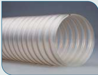
FLEXADUX HT PU POLYURETHANE HOSE FOR HIGH TEMPERATURE APPLICATIONS

Temp. -40°C to +100°C (Short-term: +125°C)