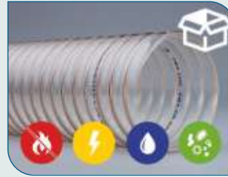
PU HOSE - PERMANENTLY ANTISTATIC AND FLAME RETARDANT

Temp. -40°C to +100°C (Short-term: +125°C)