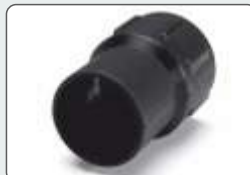
Standard crip cuff

Black screw cuff with a standard thread in different diameters. Other colours on request.