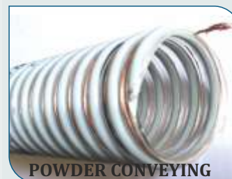
PU HOSE WITH RIGID HELIX Serie 3PUR M - AL - ANT FOOD GRADE / ANTISTATIC