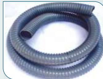
PVC FLEXIBLE DUCT HOSE GREY

Temp. -40°C to +145°C (Short-term: +165°C)