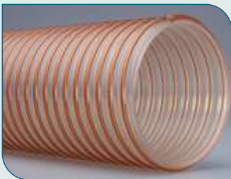
PU HOSE EXTRA HEAVY DUTY Ether Grade

Temp. -40°C to +100°C (Short-term: +125°C)