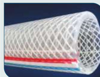
PVC STEEL WIRE HOSE WITH FABRIC REINFORCEMENT