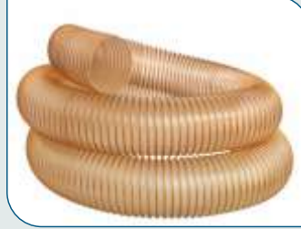
PU HOSE - HEAVY DUTY Ether Grade

Temp. -40°C to +100°C (Short-term: +125°C)