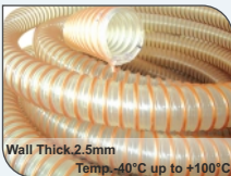
Wall Thick 2.5mm Temp. -40°C up to +100°C

Auto loaders, Hopper dryers, Multilayer film plants, Flexographic printing machine, Rotogravure printing machine, Offset printing machine, Extrusion, Blow moulding, PVC, HDPE, CPVC, PP Pipe manufacturing, Packaging Industry, Masterbatch Industry, Speciality Compounds, Food and Pharma.