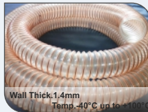
Wall Thick 1.4mm Temp. -40°C up to +100°C