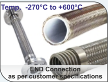
Temp. -270°C to +600°C END Connection as per customer specifications

PVC NON TOXIC SUCTION HOSE WITH ANT COPPER WIRE