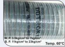
W.P. 3.5kg/cm 2 to 7kg/cm 2 B.P. 11kg/cm 2 to 23kg/cm 2 Temp. 60°C

PVC SUCTION & DELIVERY HOSE FOOD GRADE - PHTHALATE FREE - ANT