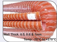
Wall Thick: 0.5, 0.6 & 1mm Temp. -70°C to +270°C

PVC STEEL WIRE HOSE FOOD GRADE - PHTHALATE FREE