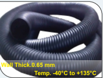
Wall Thick 0.65 mm Temp. -40°C to +135°C