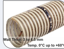
Wall Thick 3 to 6.5 mm Temp. 0°C up to +60°C

PVC SUCTION & DELIVERY HOSE FOOD GRADE - PHTHALATE FREE - ANT