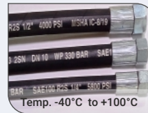
temp. -40°C to +100°C

FDA-GRADE CHEMICAL HOSE - UHMWPE W.P. 16 kg/cm 2 / B.P. 48 kg/cm 2 Steam Cleaning up to +130°C (for Max 30Minutes)