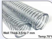
Wall Thick 3.5 to 7 mm Temp. 70°C

PVC STEEL WIRE HOSE FOOD GRADE - PHTHALATE FREE