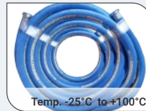
Temp. -25°C to +100°C

FLEXIBLE METAL HOSES S.S. CORRUGATED FLEXIBLE HOSES Stainless steel AISI 304, AISI 321 and AISI 316L EN ISO 10380