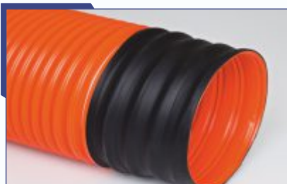
Vacuum Lift Hose - Orange Range: 100,120,140,150,160,180,200 mm Temp: 85°C