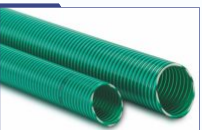
PVC Suction Delivery Hose - Green W. P : 3.5kg/cm 2 to 7kg/cm 2 B. P : 11kg/cm 2 to 24kg/cm 2 Temp: 60°C