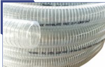
PVC Steel Wire Hose Wall Thick. : 3.5 to 7 mm Temp: 70°C