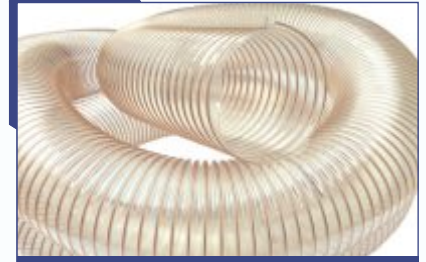
PU Hose Heavy Duty Wall Thick. : 0.6 mm Temp: 100°C