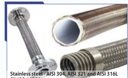
Stainless steel - AISI 304, AISI 321 and AISI 316L EN ISO 10380