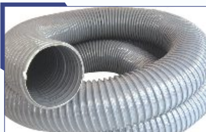
PVC Duct Hose - Grey Temp: 60°C