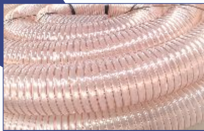
PU Hose Heavy Duty Wall Thick. : 0.7/1.4 mm Temp: 100°C