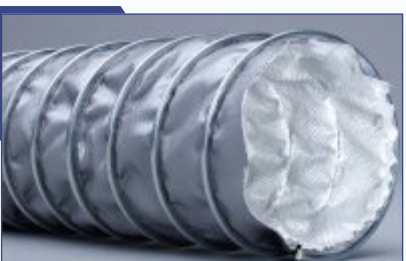
High Temperature Clip Hose Temp: 300°C to 1100°C