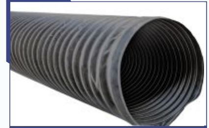
Vacuum Lift Hose - Black Range: 100,120,140,150,160,180,200 mm Temp: 85°C