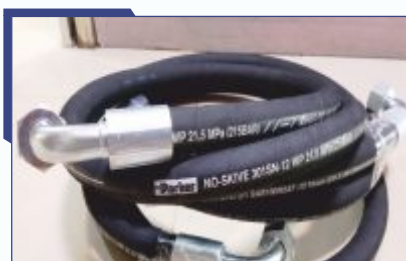
Hydraulic Hoses W.P : 40 to 230 kg/cm 2 B.P : 163 to 920 kg/cm 2 Temp: 100°C