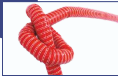
Silicon Hose Double Layer Wall Thick. : 0.7 / 1 mm Temp: 300°C