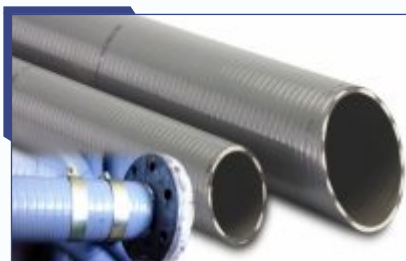
PVC Suction Delivery Hose - Grey W. P : 2.5kg/cm 2 to 8kg/cm 2 B. P : 6kg/cm 2 to 25kg/cm 2 Temp: 60°C