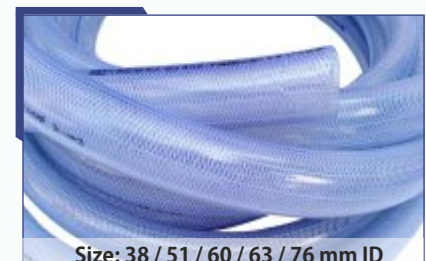
Size: 38 / 51 / 60 / 63 / 76 mm ID PVC Braided Hose - Heavy Duty Wall Thick. : 2.5 to 8 mm Temp: 60°C