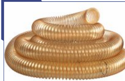
PU Hose Light Duty Wall Thick. : 0.4 mm Temp: 100°C