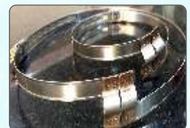
S.S. BRIDGE CLAMP