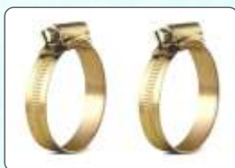
M.S. HOSE CLAMP