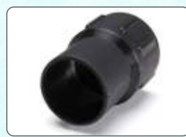
Standard crip cuff

Screw cuff for different hoses and diameters.