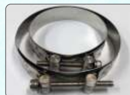
S.S. / M.S BOLT HEAVY TYPE & O.H.T.C. HOSE CLAMP