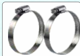
S.S. HOSE CLAMP