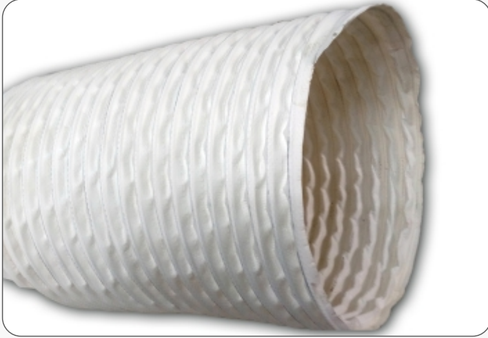
Heavy Duty Antistatic and Flame Retardant