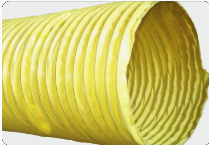
Heavy Duty Flame Retardant