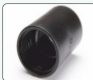
Coupling Screw cuff for different hoses and diameters.