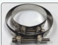
S.S. / M.S BOLT HEAVY TYPE & O.H.T.C. HOSE CLAMP