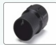
Standard crip cuff Black screw cuff with different threads and out of various materials. Other colours on request.