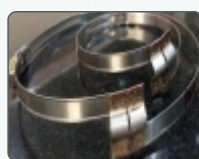
S.S. BRIDGE CLAMP