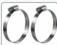
S.S. HOSE CLAMP