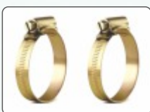
M.S. HOSE CLAMP